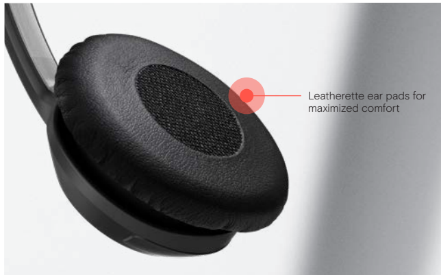
Leatherette ear pads for maximized comfort