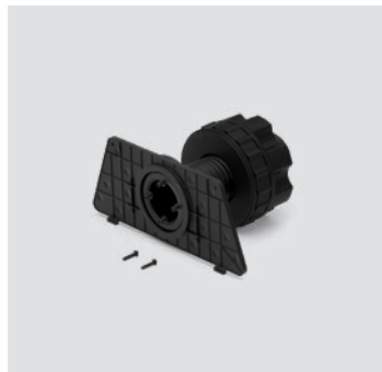
Control - DM 01