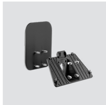
Control WM - G