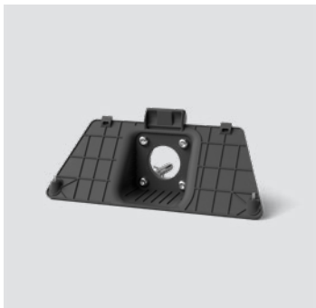
Control - WM 01